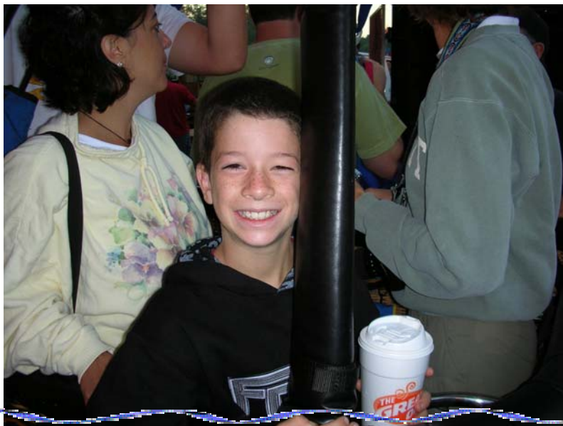
Nov. 12, 2005 9 Balloons launch at Kathy's

C hchchchchchch! That's the sound of the aeronauts checking the burner. Vvvvvvvvvvvvvvvvv! That's also the sound of the fans blowing up the balloon. The smell of the propane, yup it's definitely the balloon rally. The music here is blasting but I still hear my family calling me to help out. They start the fan and I hold the mouth of the balloon open so the air can get in. When it's full, it's as big as a house and it's ready to lift off its side and stand up. The burner is hot and makes my hands feel like they're on fire and they're going to fall off. When I'm done I have to wipe my hands because they're all sweaty. I get in then they do the burner and we lift in less than a second. And from there it's smooth sailing. I look down and the cars look like toys. The balloon can carry you like a person can carry a feather. The balloon hovers overhead of everything on the ground. Once we find a spot to land we take the balloon down. Once we get packed up we head to the firehouse because there they give us free food. I can taste the bacon, eggs and the pancakes in a perfect combination but that's not why I love ballooning!