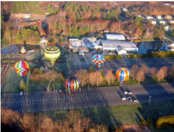
A pretty morning at the Aqua Turf in 2005