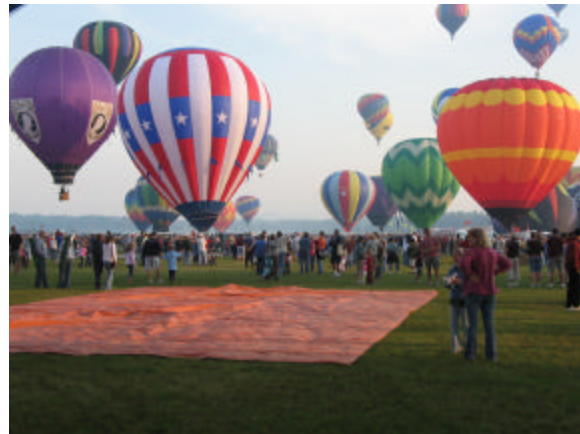
Adirondack balloon festival