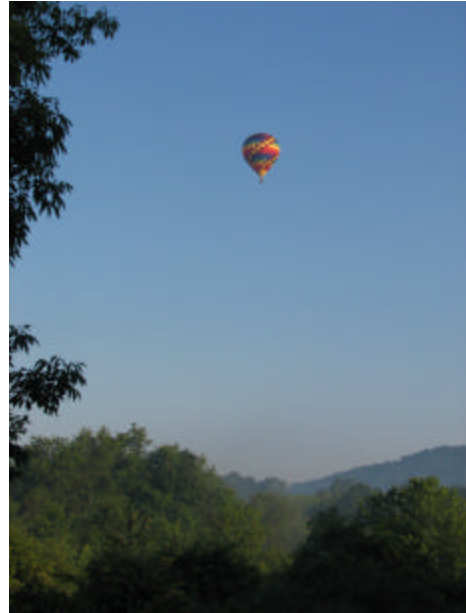
Erwin Dressel flies high above on a “misty morning.”