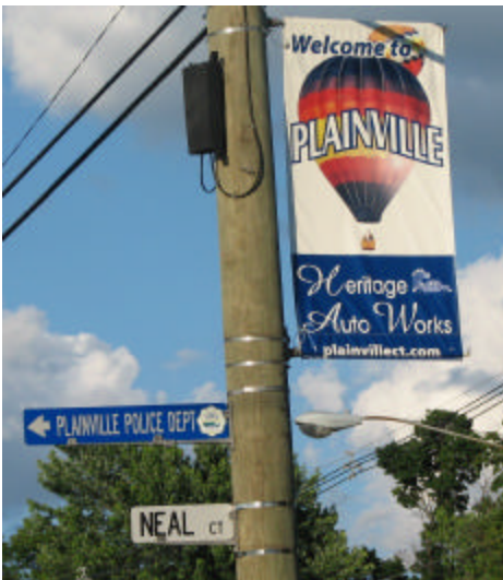
Has anyone else noticed these signs that line the streets of Plainville? This one is on the lightpole leading to our CLAS meetings at the Plainville Police Department. June 19, 2008